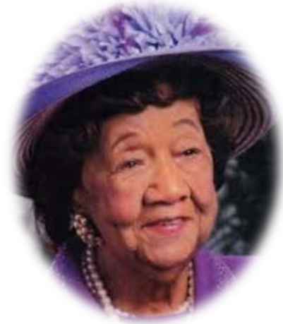
Dorothy Irene Height President, Emerita

Dr. Johnnetta B. Cole, President, National Council of Negro Women, Inc.