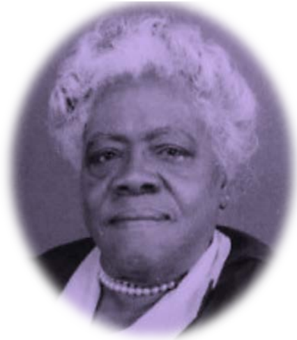
Mary McLeod Bethune NCNW, Founder